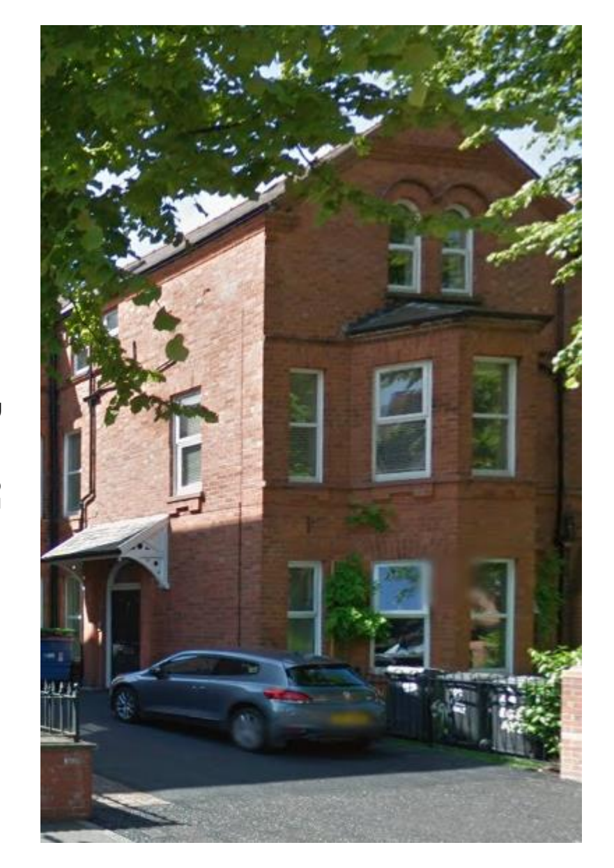
Appendix 1 – External Photograph and Location Map – 71 Eglantine Avenue, Belfast, BT9 6EW