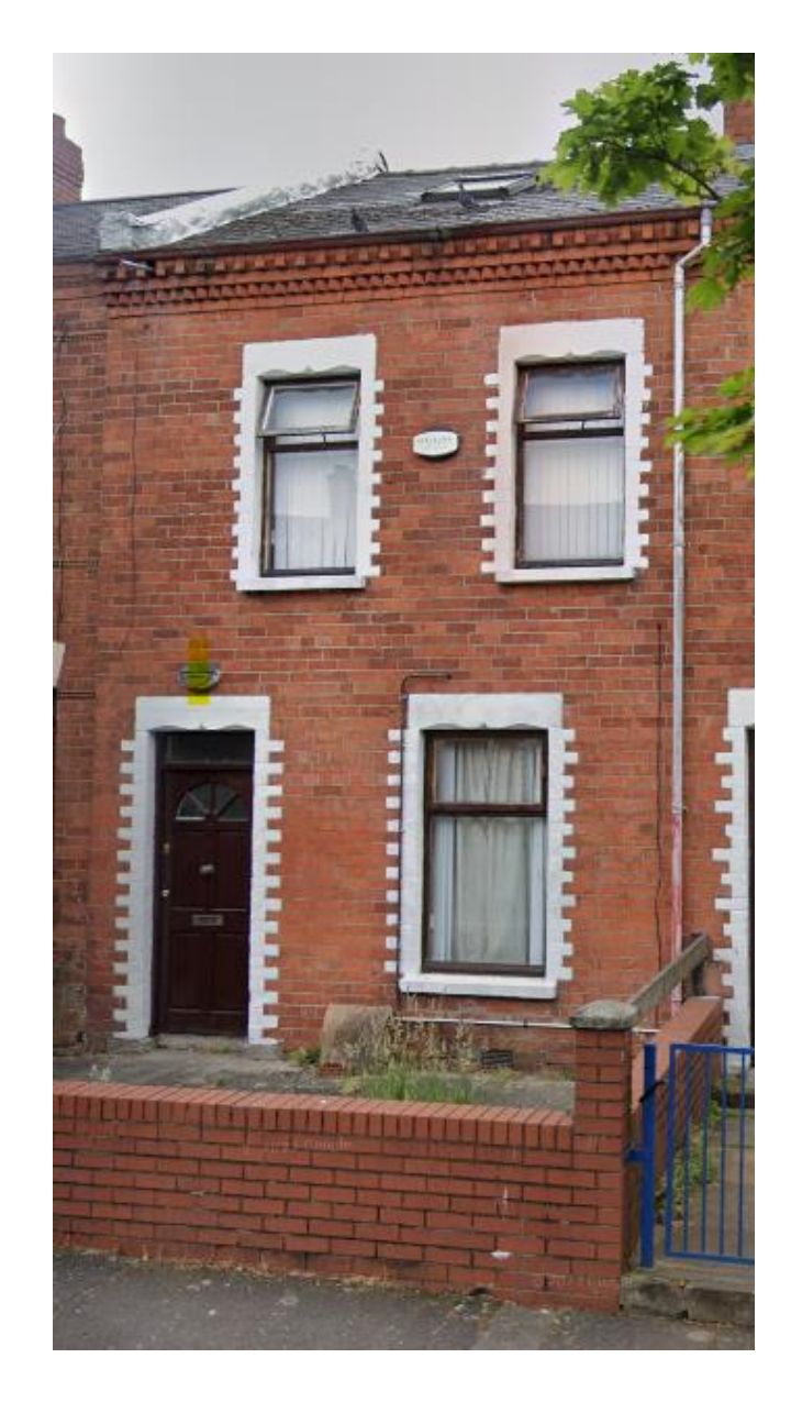
Appendix 1 – External Photograph and Location Map – 22 Penrose Street, Belfast, BT7 1QX